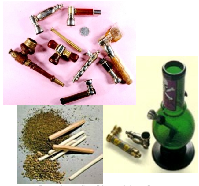
Paraphernalia-Pipes, Joints, Bong

awareness of senses Dry mouth (cotton mouth) Increased appetite (munchies) Sleepiness Dizziness & clumsiness Bloodshot eyes Anxiety & paranoia Poor short-term memory Racing heartbeat