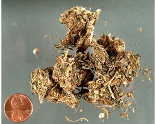
Dried Marijuana Buds and Seeds

Marijuana is the most commonly used illicit drug in the United States. Its main psychoactive chemical is delta-9-tetrahydro-cannabinol , or THC. Due to the variety of effects it can produce, marijuana can be categorized as a stimulant, depressant, or hallucinogen.